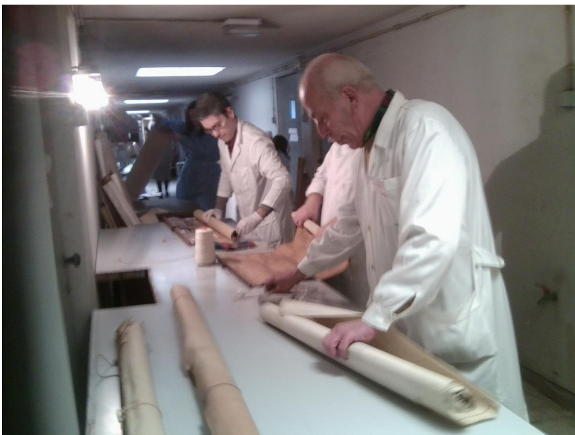
Figure 3 The MUHNAC team cleaning teaching wall charts during a conservation session at the Hygiene and Tropical Disease Institute (IHMT), 2013, Lisbon